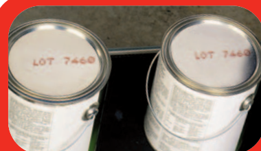
Top, side or bottom printing.