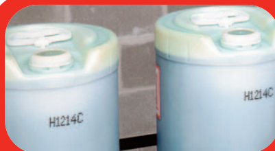
Prints 1 line, up to 50 characters.

The IV700 is the market's best value among low-cost large character ink jet printers. Designed to surpass competitive systems in print quality, print speed, message control and printhead flexibility, it offers reliable printing of single-line codes at a very affordable price.