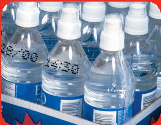
IV700 prints on porous and non-porous surfaces.