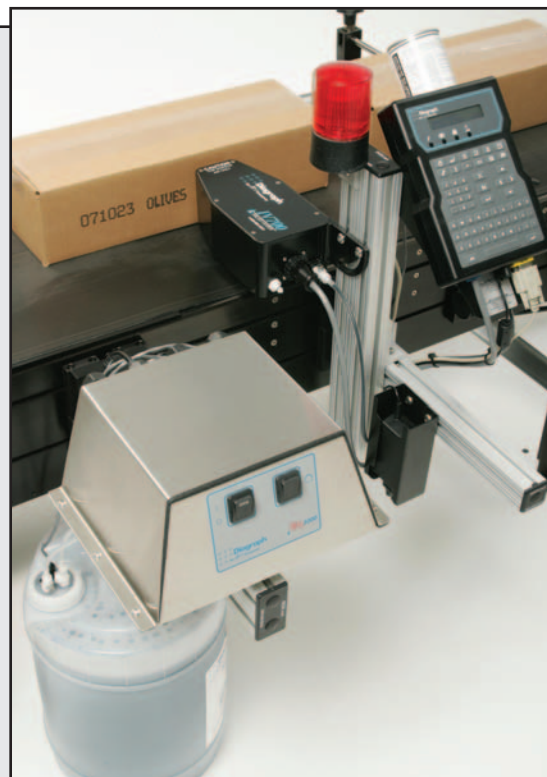
IV700 shown with optional bulk ink delivery system and alarm beacon assembly.